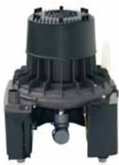
V 300 S