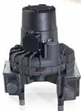
V 1200 S