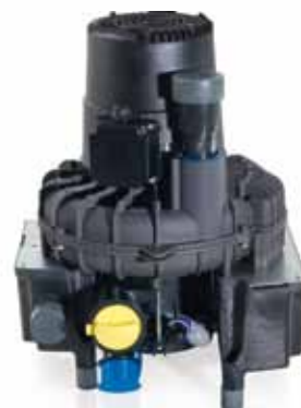
VS 900 S