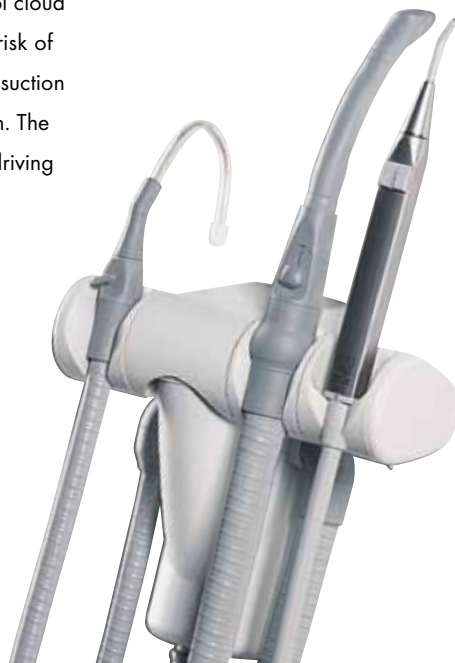
The modular Dürr Dental Comfort hose manifold, shown here with the saliva ejector, Universal Cannula III, and a syringe element

The suction systems of market leader Dürr Dental deliver top performance when it comes to suction power. Thanks to their robust design, they have an extremely long service life while reducing maintenance efforts. Investing in a Dürr Dental suction system really pays off – not only through the facilitation of daily treatment but also because such systems reduce operating and maintenance costs.