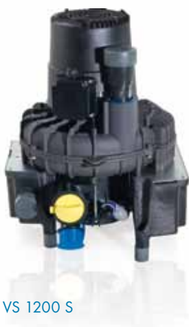
VS 1200 S

Thanks to the installation frame, the Dürr Dental flow accelerator is easily accessible in the base