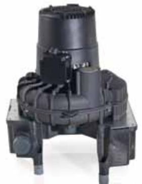
V 900 S