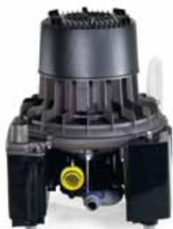
VS 300 S