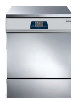
Tethys T60 - Tethys D60