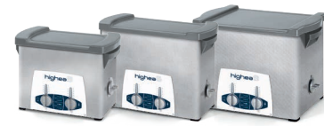
Highea 3-6-9 WASHING