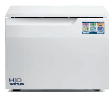
Tethys H10 plus THERMAL-DISINFECTION