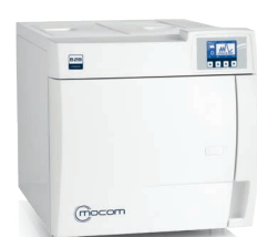
B Classic STERILIZERS