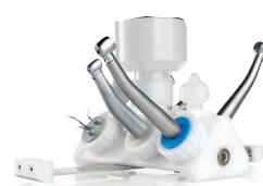
HMD H10 HMD ACCESSORY