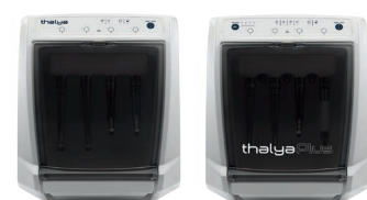
Thalya - Thalya PLUS HANDPIECE TREATMENT